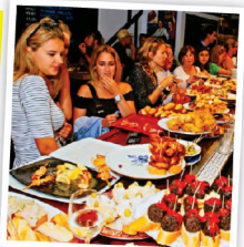
Luck in: A pintxos bar in the city

DOUBLE rooms at Villa Soro start from £250 (£202 per night B&B, hotelvillasoro.com . British Airways offers direct flights to San Sebastian. Easy Jet and Vueling fly to Bilbao, and so 60 miles away, Brittany Ferries has two sailings weekly from Portsmouth to Bilbao, brittanyferries.co.uk . For more information about San Sebastian, visit sansebastianturismo.es/en/