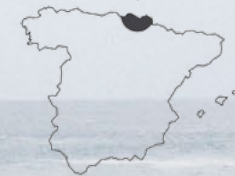
THE BASQUE COUNTRY SPAIN

This political autonomy translates to the unique culinary culture that has developed here. Thanks to the region's privileged geographic position, local chefs have access to the freshest raw materials from land and sea. With more Michelin stars per capita than any other region in the world, a journey across the Basque Country is the ultimate epicurean pilgrimage.